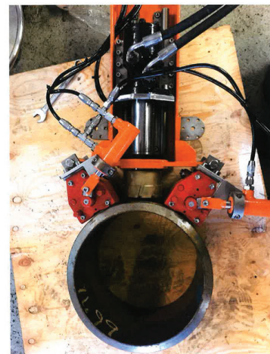
Drilling tool connected to pipe. B! The dimensions of the pipe must be at least 450 mm. diameter.