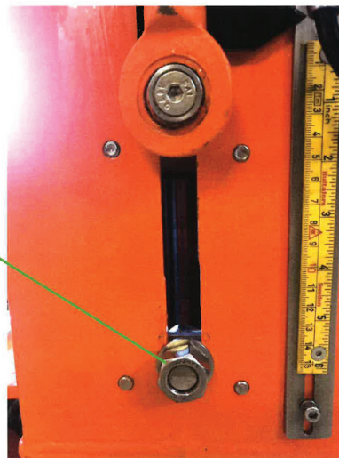
For easily measuring drilling depth. Nut for adjustable drilling depth. Nut can easily be removed for maximum drilling depth.